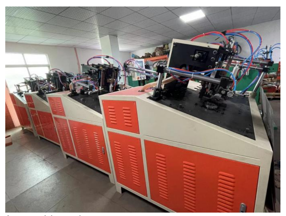
A corner of the warehouse

Our purpose: Every device, we must do better!!