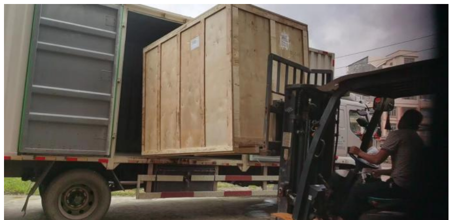
Packaging and exporting to the world