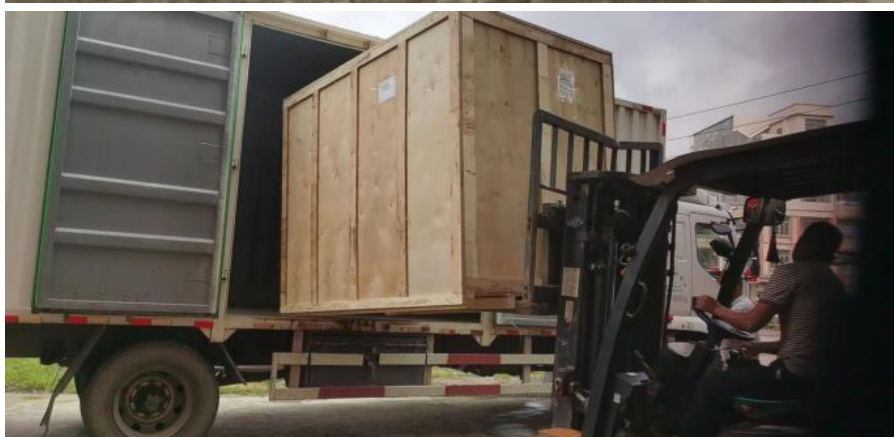
Packaging and exporting to the world

Our purpose: Every device, we must do better!!