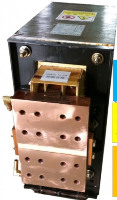
台湾水循环变压器 water circulation Taiwan transformer

All red copper water circulation control device of transformer, water-saving forced cooling, imported high-grade silicon steel, with long service life, high conductivity, low power consumption and strong current. And equipped with temperature control system, overheating and overload will automatically power off for protection.