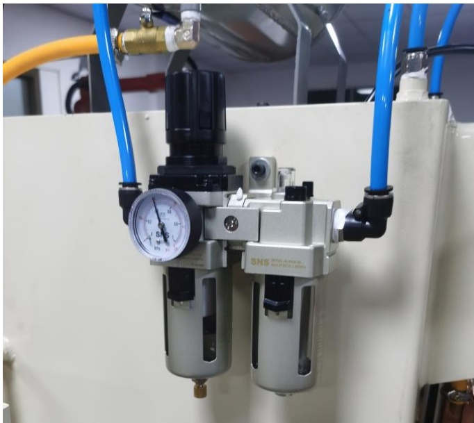
1-4 The large capacity air receiver makes the spot welding machine more stable pneumatically.