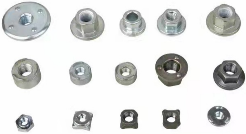
螺母自送料点焊机参数Technical parameters of nut automatic feeding spot welder