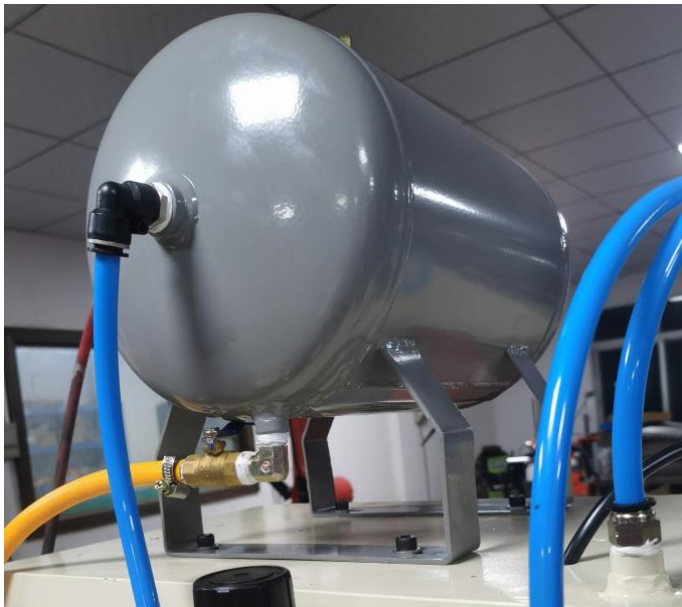
1-6 Water circulating water-cooled electrode