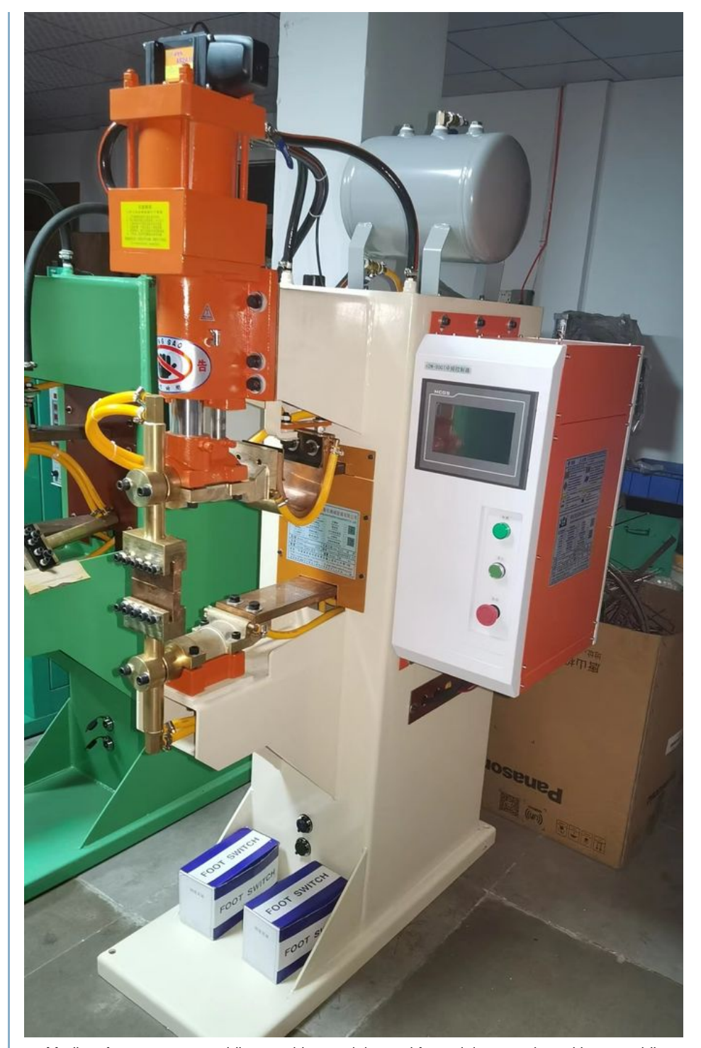
Medium frequency row welding machine, mainly used for stainless mesh, multi spot welding. The welding is firm and the surface is beautiful.