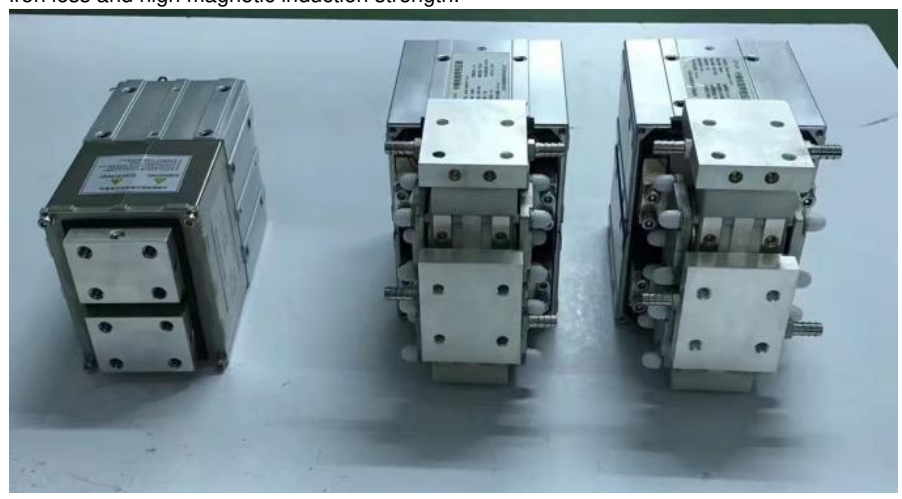
Workshop display of intermediate frequency spot welding machine