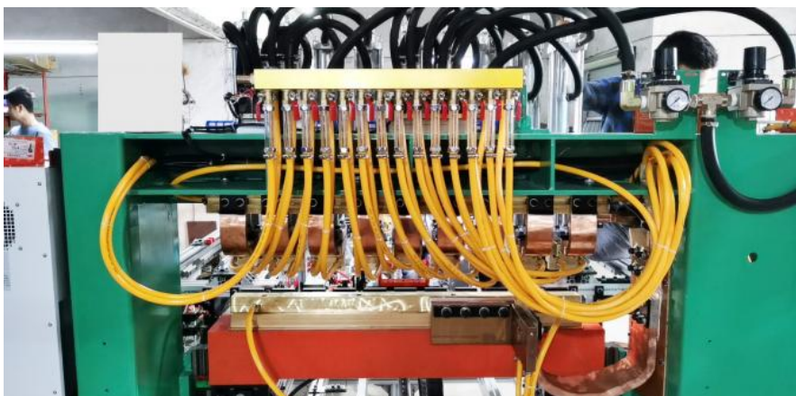
Principle of spot welding

4.The transparent water flow valve is customized in Taiwan. There are nearly 100 cylinder + solenoid valve actions of gantry welder, and dozens of water circulation. With this gadget, no matter which route has a problem, it is easy to find and see it safely,