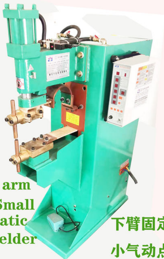
Lower arm fixed Small pneumatic spot welder

row welding machine, pneumatic spot welding machine, welding machine, pneumatic precision spot welding machine, resistance spot welding machine, three-phase spot welding machine, Customized spot welding machine, Taiwan spot welding machine, gantry spot welding machine, small spot welding machine,