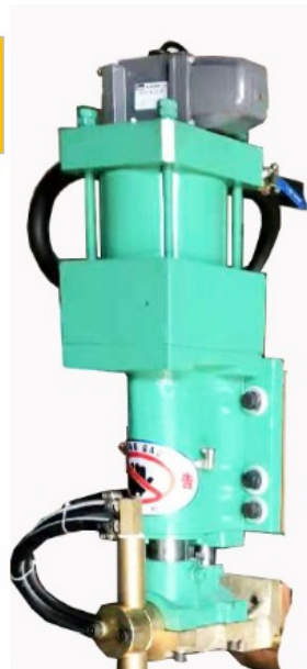
Connected large air cylinder

2. All red copper water cooling temperature control device of transformer has the advantages of long service life, low noise, safety and convenient use.