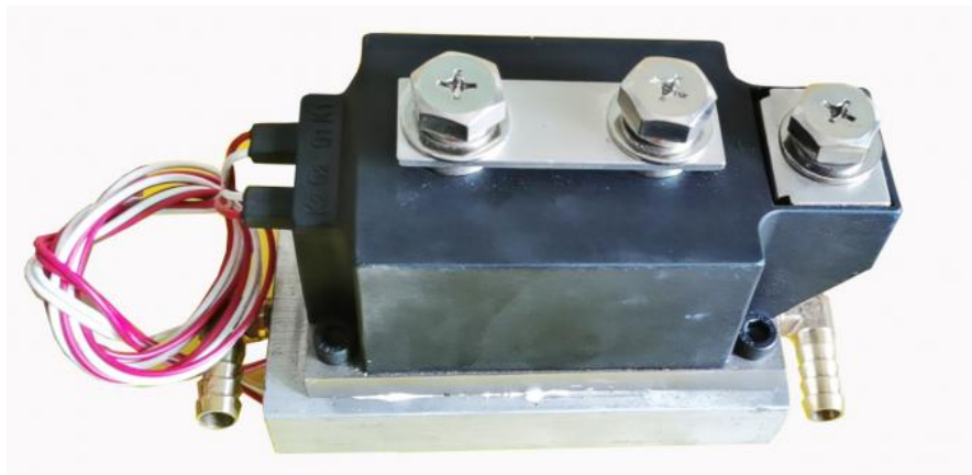
Principle of spot welding

3.The water-saving forced cooling mode is adopted, and the main circuit adopts high-power SCR contactless switch, with high conductivity and low power loss , High temperature automatic protection.