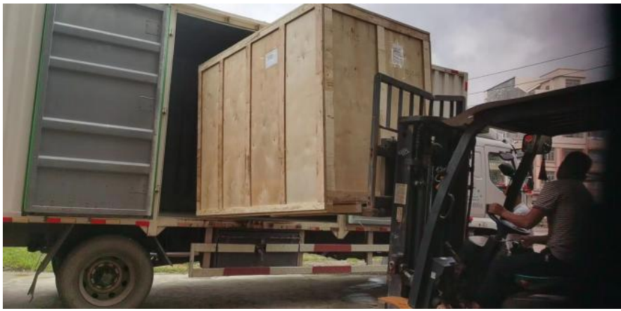
Technical parameters of fast looping butt welding machine