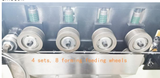
4 sets, 8 forming feeding wheels