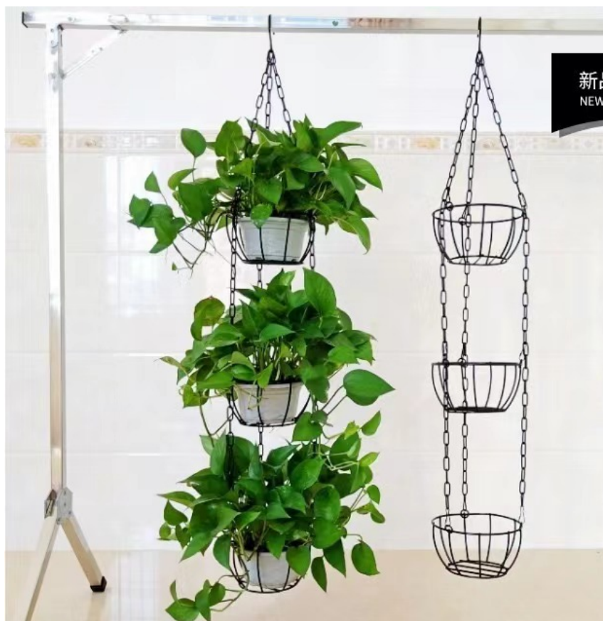
Flower pot rack display