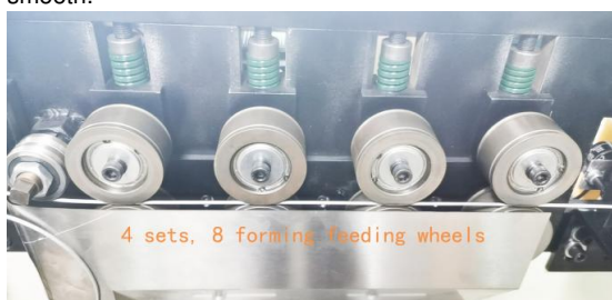
4 sets, 8 forming feeding wheels