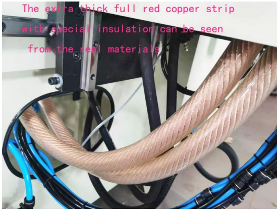
The extra thick full red copper strip with special insulation can be seen from the real materials