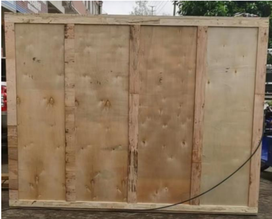
Packing export, export standard wooden case.