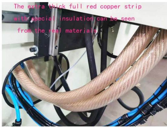
Assembly workshop of all-in-one circular butt welding machine