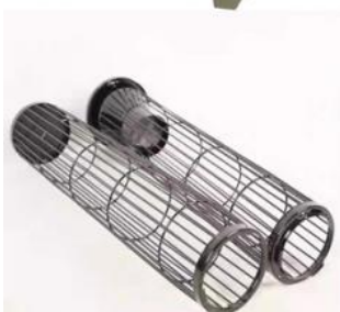
Environmental protection dust removal framework display