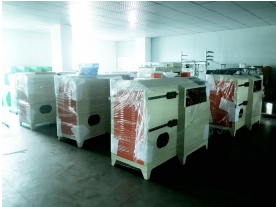
Technical parameters of fast looping butt welding machine