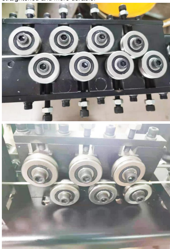
Assembly workshop of all-in-one circular butt welding machine