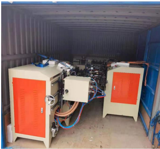
Technical parameters of fast looping butt welding machine