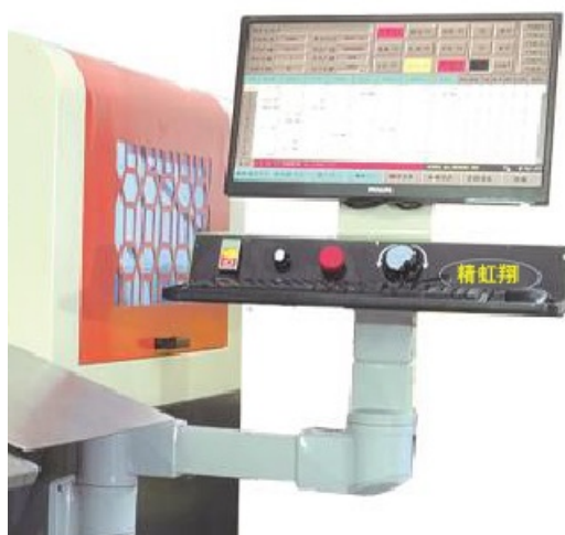
3D bending product display

F-needle monitoring can respond immediately after 1US the probe is encountered, which can ensure the consistency of each product.