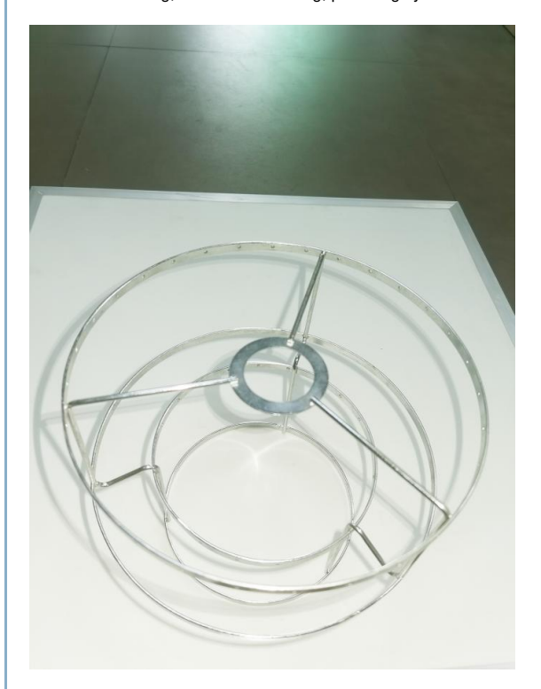
Production workshop display

Multi function looping machine, widely used, can be used as long as it is a flat iron circle or a flat iron circular arc Convenient setting, automatic counting, punching cylinder can be one cylinder or two cylinders according to needs