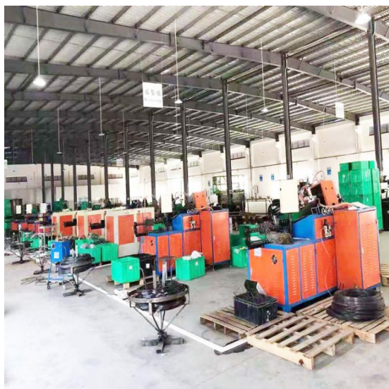
Product Application Display Bending + punchi Lighting hardware flat iron products