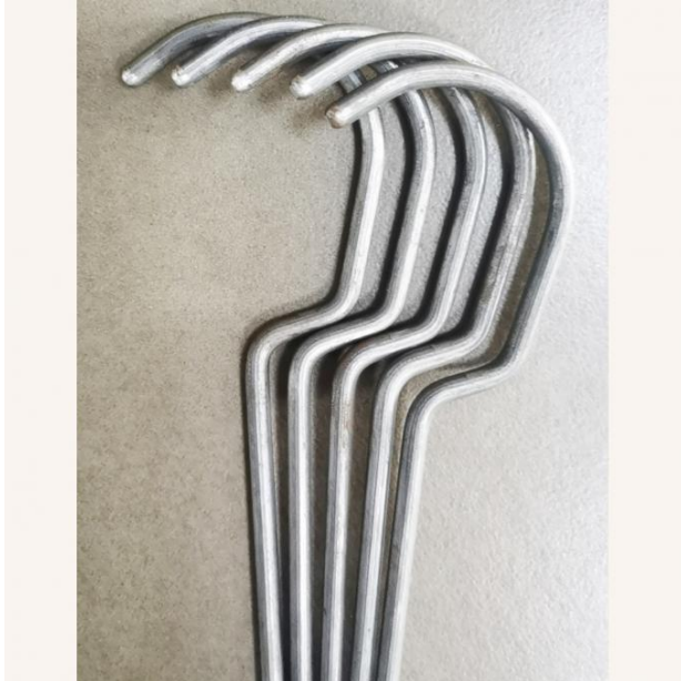
Supermarket double hook