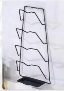
{ 升级四层 }