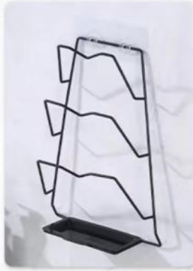
{ 标准三层 }