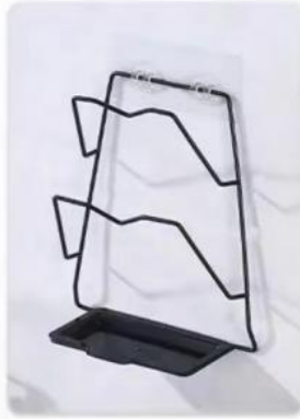
{ 简易双层 }

JUST TO MEET YOUR NEEDS COLORS ARE COLORFUL AND I GO MY OWN WAY