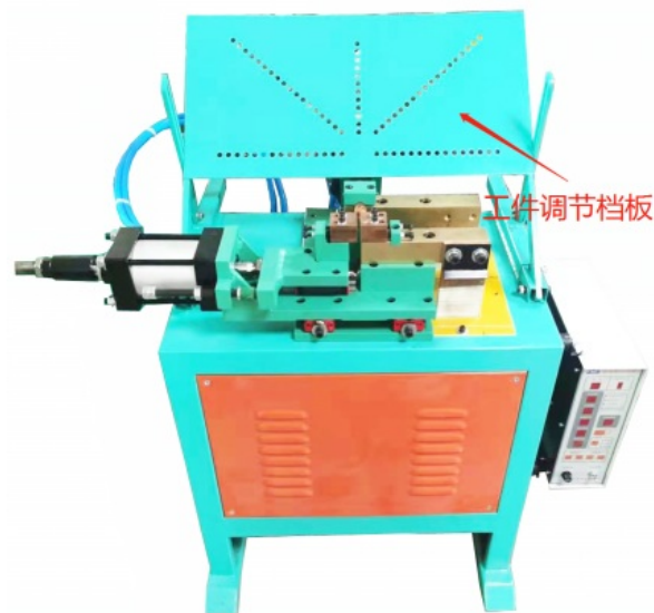
4. The special workpiece adjusting baffle can support the workpiece and adjust the welding angle of the workpiece for large workpieces, which is very useful.