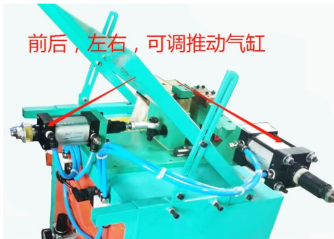
3. The front, rear, left and right cylinders can be adjusted to make the welding position more accurate and the welding melting point can be controlled to be more ideal.