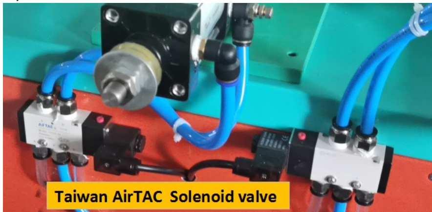
5. Taiwan AIRTAC solenoid valve, a solenoid valve with the same effect, is more durable and faster.