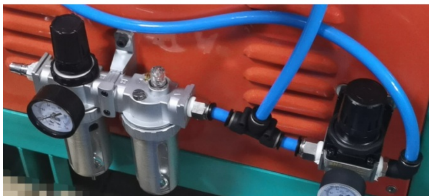
6. Taiwan SNS pneumatic components, air pipes and connectors. Independent two-piece, pressure reducing valve, convenient adjustment, oil