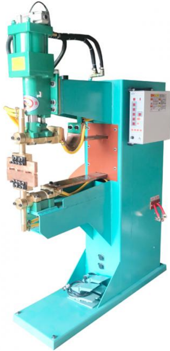
Welding product representative